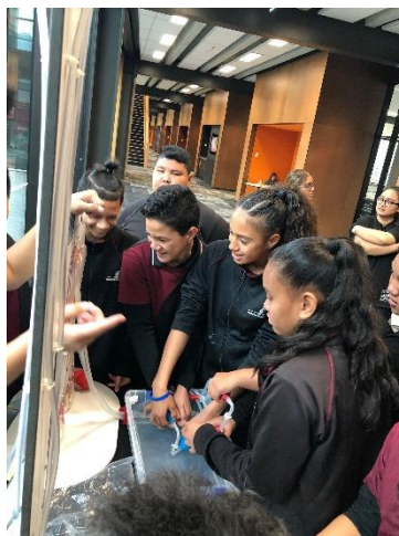
Enjoying the Brave Heart exhibition at AUT South